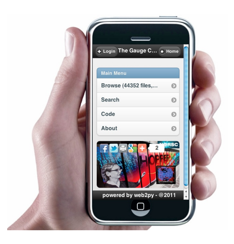
Figure 1: The main web page for qcd.nersc.gov allows browsing and searching for gauge ensembles.